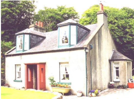
The acid works house (now Black Glen).