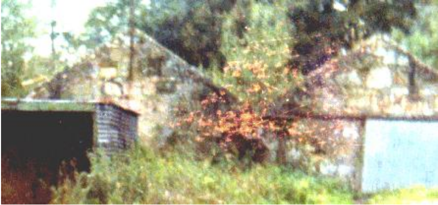
The two-bay rubble shed photographed in 1970. The kiln and chimney, not seen here, were behind this building.