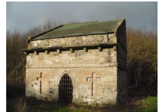
Dovecot, Eglinton Park, Kilwinning

Please pass this on to anyone who you think may be interested in the work of the Society.